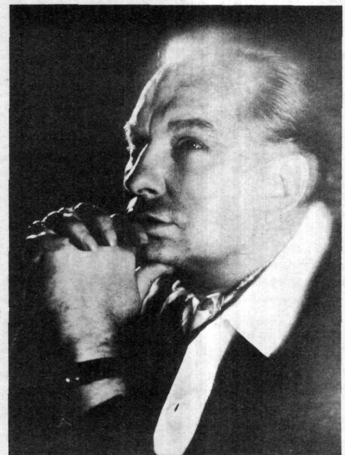
L. Ron Hubbard, Founder

This year become one of the most able people in the world, a Class VI Auditor!