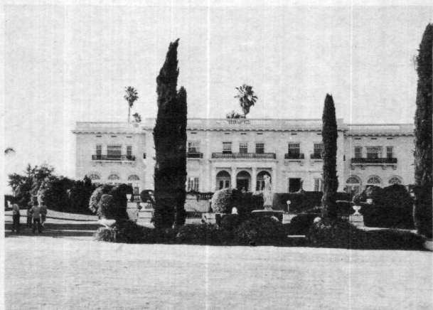
The Auditors' Guild's beautiful new house in South Pasadena.

The Guild has just acquired a very elegant house in Pasadena with 5 acres of grounds, to serve as a central meeting place where they can bring friends and new people for the communication course now being given there.